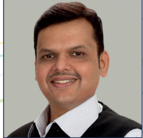
Hon. Shri. Devendra Fadnavis Dy. Chief Minister, Maharashtra State