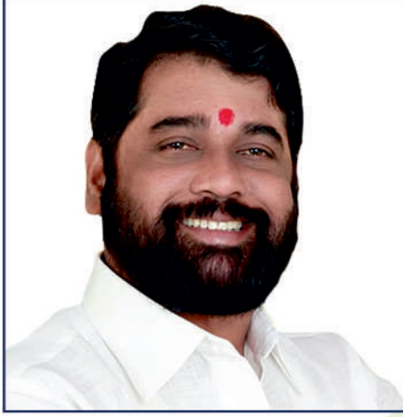
Hon. Shri. Eknath Shinde Chief Minister, Maharashtra State